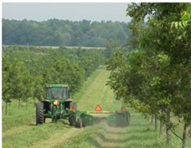
Pecan/hay alley cropping at work

University of Missouri Center for Agroforestry (UMCA) http://www.centerforagroforestry.org/events/AgroforestryAcademy.php