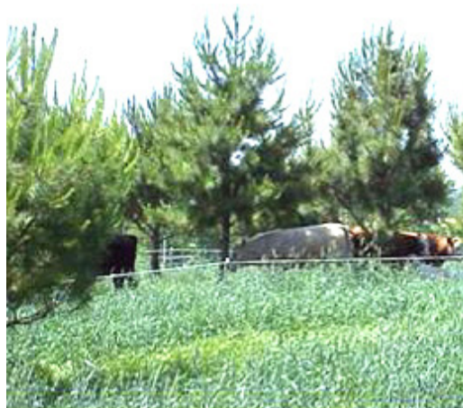
A single row of pine and fencing allows for managed paddock grazing based on forage response to grazing.

Finally, crown management through pruning may be beneficial if the desired tree product is nuts. An open crown not only allows more light to reach interior branch tips (necessary for flowering and fruiting), but also will allow increased light to filter through to the forage.