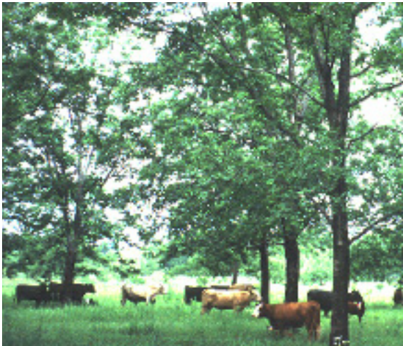
Cattle graze among Missouri pecan trees in this well-managed silvopasture practice.