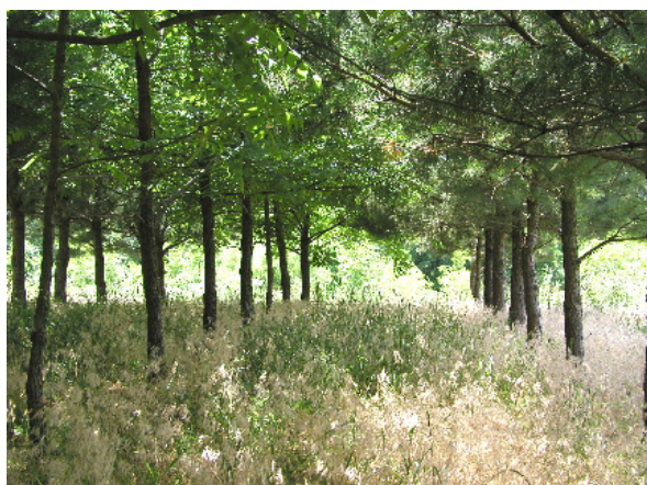
Annual rye and timothy grass grow well in shaded environments, as shown here under 8-year-old walnut grown between rows of pine.