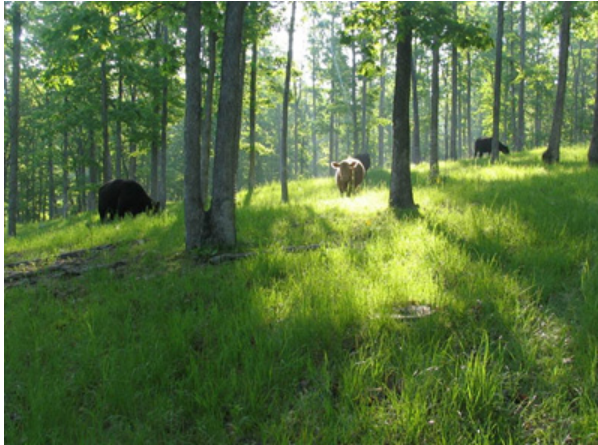
Hardwood silvopasture under white oak at the MU Wurdack Research Center.