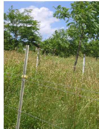
Fencing, placed approximately 3 feet from tree seedlings, is effective at reducing browsing damage from livestock.