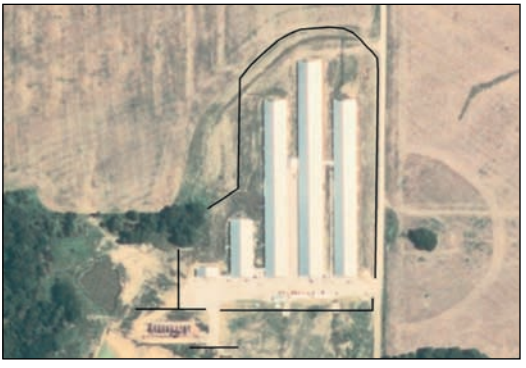
White rows show the CAFO buildings from overhead. The black lines are where the wind/odor breaks have been constructed.

Walter said the goal for the project is to determine if windbreaks for odor abatement are both effective and cost efficient for large agricultural operations. Another feature of using a windbreak for this purpose is that the trees can serve to landscape the site and create a more pleasing appearance.