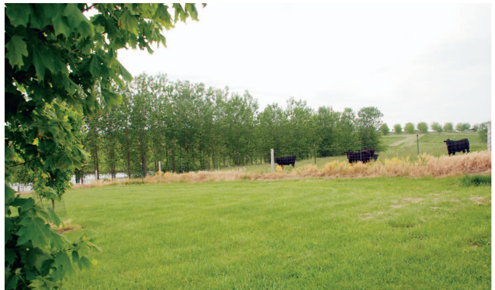
Cattle graze up slope from a tree buffer and water source at the Horticulture and Agroforestry Research Center, New Franklin, Mo.

Researchers are working to synthesize a potent atrazine-degrading enzyme in the lab – this compound from the root of eastern gamagrass can degrade atrazine in 20 minutes. The spore-based and nanocarbon-based biocatalysts were successfully developed through collaborative efforts with MU Life Science Center, MU departments of engineering, biopathology, biochemistry, and USDA-ARS. These novel biocatalysts were customized to rapidly degrade organic pollutants including agrochemicals (including atrazine) and explosives (TNT, for example) in the environment. Commercial applications are being assessed; two patents have been filed.