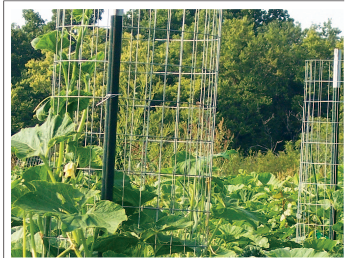
A new grafted chestnut planting is intercropped with pumpkins during the establishment phase of the orchard.

Studies looked at grass sods as living mulches when establishing black walnut, northern red oak, black locust and pitch x loblolly pine. This study compared the competitive nature of forage grasses grown with trees and evaluated possible interactions between soil moisture, soil nutrients and fertilization. In general, tree growth differences were not attributed to differences in endophyte status, suggesting the tall fescue endophyte has little effect on tree growth in pastures. Lack of consistent interactions with nitrogen fertilizer and/or irrigation indicate neither cultural practice will effectively reduce the detrimental impact of grass sods on hardwood seedling growth. In 2011, researchers will reconfigure plots from this study to begin quantifying how grass sods suppress growth and how much area under tree crowns must be free of grass to have acceptable sapling growth.