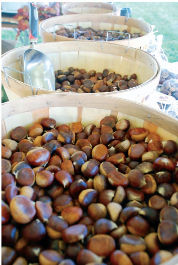
Chestnuts are sorted according to size to sell at the 8th annual Missouri Chestnut Roast, Oct. 16, 2010.

The UMCA socio/economic/marketing cluster looks at human and economic dimensions of agroforestry including individual attitudes, knowledge, incentives and social-economic-resource characteristics; the role of institutions in constraining or facilitating agroforestry; specialty crop financial decision models; knowledge of markets for new products; the role of agroforestry in agritourism; and networks that facilitate access to information about agroforestry practices. The cluster also created and administers the Missouri Exchange Web site, an online marketplace for buyers and sellers of Missouri agricultural products. See the interactive site at www.missouriexchange.com