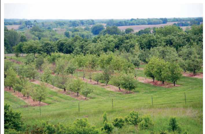
TOP: HARC’s new teaching vineyard. MIDDLE: Pine straw demonstration area at HARC. BOTTOM: One of many chestnut orchards at the Horticulture and Agroforestry Research Center, New Franklin, Mo.