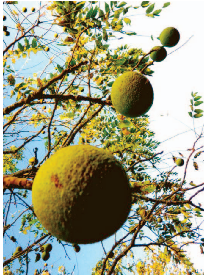
Photo of black walnut

A total of 45 new accessions were established in a fourth clonal repository at HARC in fall 2010. These recent additions