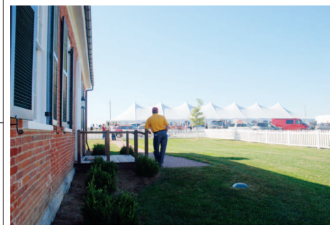
TOP: Chestnut sampling. ABOVE RIGHT: The chestnut roast festivities are seen from the Hickman House. ABOVE LEFT (TOP): Enjoying the straw bale maze. ABOVE LEFT (BOTTOM): Goatsbeard Farms cheese booth was a popular place.