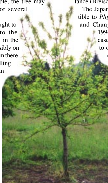
Symptoms appear in the spring with trees producing smaller than normal and yellowish leaves.